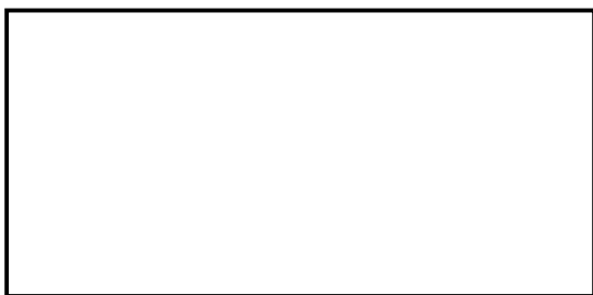
Figure 4: Topographical maps showing Wilcoxon rank-sum values difference of the EEG power-saccade rate coherence values between successful and failed trials, where saccade periods (from one oscillation cycle before saccade onset to one oscillation cycle after saccade offset) are excluded from the analysis.

In order to remove residual ocular artifacts in EEG signals, we analyzed the coherence values only during eye fixation periods. The result is shown in Figure 4. A significant coherence increase was again found at theta range (4.0-6.5 Hz) in the fronto-central region, confirming that the EEG theta power-saccade coherence increase is not caused by ocular artifacts. Moreover absence of significant effect in the occipital regions indicates that the subsequent memory effect in the occipital region is more related to periods of saccade occurrence. The subsequent memory effect in the fronto-central region is considered to be more independent of saccade timing.